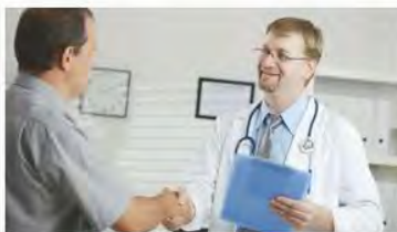
Legal Help for Seniors