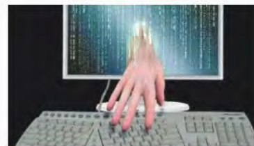
Dealing With Identity Theft