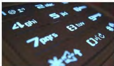
Legal Advice Hotlines

Home About Us Apply Online Hotlines Our Services Self-Help Forms Library Contact Us